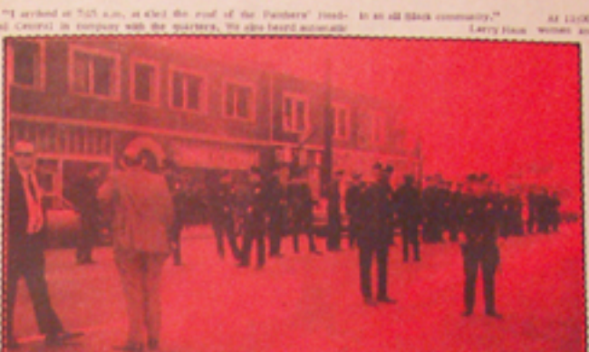
Fascist troops mill around after attempted massacre.

of the Black Panther Party in Los Angeles. The Walker "Three" Pope Community Center, located at 1200 E. Exposition, was the home of the year gaining and brutal beating of four Panthers. As each Panther exited the Center, he was surrounded by a mob of about 200 men, some of whom were wearing gas masks and holding rifles. The pigs thought would make complete, the genocide of the Black Panther Party in Los Angeles. Under the same program that was used at all of the other locations the killing of warriors, the fascist troops attempted to gain entrance to the building. Examples of the machine that the pigs used in the raid were tear gas, shotgun, revolvers, M-16 assault rifles, gas masks, and even a tank was left in parking.