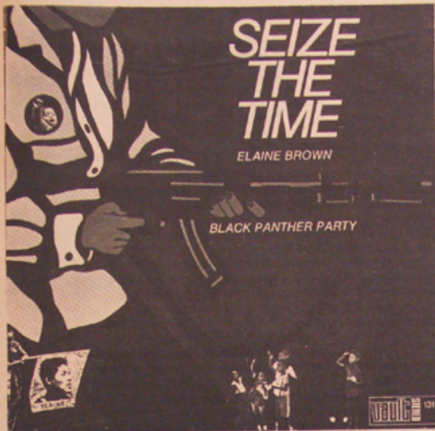
Designed By Emory