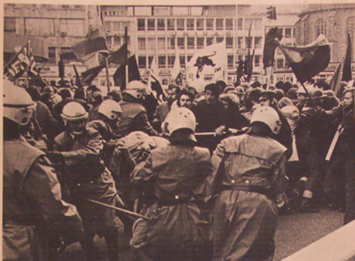
GERMAN - FASCIST PIGS