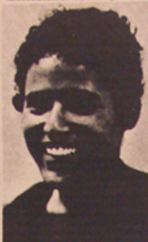
Elaine Brown, Black Panther Party

namese for the freedom of Huey Newton and Bobby Seale. Such negotiations have placed the power of Black people in Babylon on an international level, linking us with