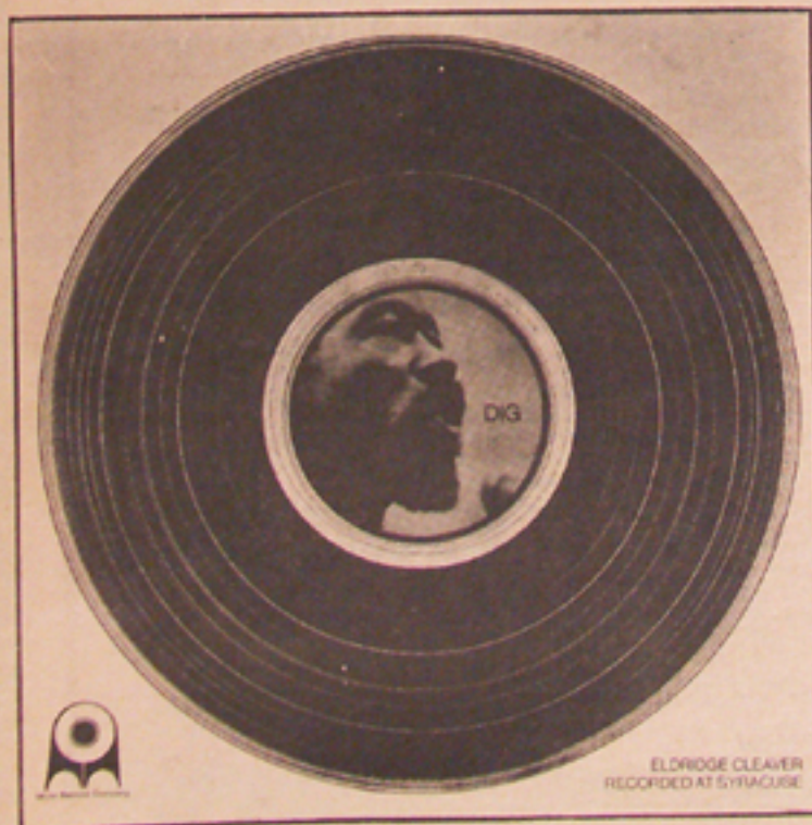
ELDRIDGE CLEAVER RECORDED AT SYRACUSE