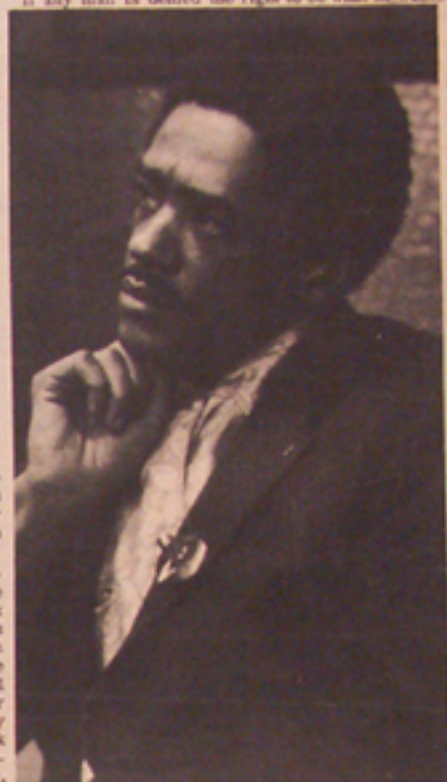
CHAIRMAN BOBBY SEALE, POLITICAL PRISONER

U.S. courtroom like a slave who spoke of freedom. Dred Scott of 1857. Bobby as well as many political prisoners is being subjected to the most fascist, racist tactics that this capitalistic/racist country has to offer. If any man is denied the right to be what he wants