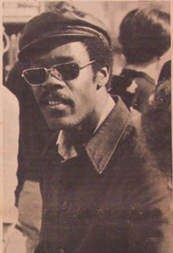
CHIEF OF STAFF DAVID HILLIARD, BLACK PANTHER PARTY

people all across Babylon when he said, "You're either part of the problem or part of the solution". The attempt to kill him was a failure and resulted in exile, a painful forced separation from the people that he loves and fights for. Bobby Seale, Chairman of the Black Panther Party and co-founder along with Huey P. Newton, formulated the most articulate statement of verbal position that Black people in racist America have put forward. This is the program and platform of the Black Panther Party. The platform and program in essence dealt with the need for, and manner and means to gain "land, bread, housing, education, clothing, justice and peace." In the case of our Chairman Bobby Seale, point number nine of our Ten Point Platform and Program was particularly ironic. Point number nine says, "We want all Black people when brought to trial to be tried in a court by a jury