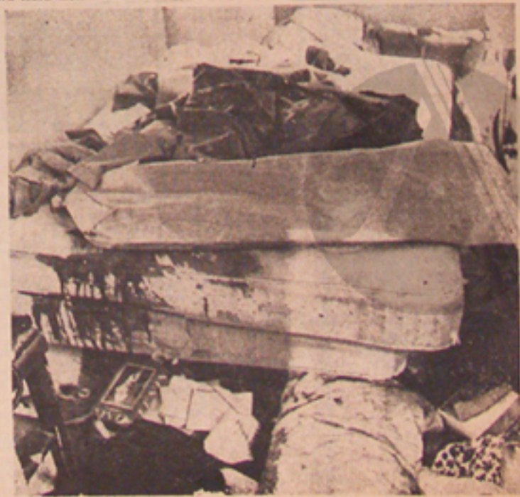
BED IN WHICH FRED HAMPTON WAS MURDERED