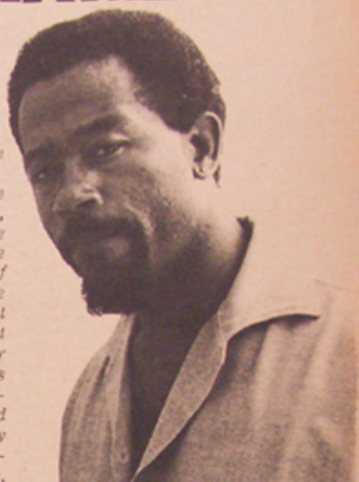
ELDRIDGE CLEAVER MINISTER OF INFORMATION BLACK PANTHER PARTY

We of the Union of the Population of Cameroon mingle our tears with yours for the sad passing of these brothers. We do so, not because they are of African extraction, but because they gave the best of their lives to a just cause. The cause of freedom and just- ice for all. The murderers must be