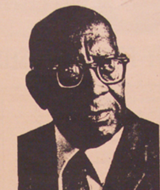
William L. Patterson

In the anti-racist activities of its athletes Black America scores another "first". The magnificent democratic struggles of Black athletes to destroy racism which is a curse to the campus and which has done so much to turn the educational system, so-called, into a system of miseducation gives Black America another first in the mounting conflict for peace and democracy. The Black athlete moves forward politically to free himself and all others from the serfdom of college athletics, to establish equality of social rights and political opportunities for athletes. He calls for a practical expression on the playing field of the humanities that have found no place in the class room. But the New York Times is very solicitous of the future of the Black athlete, a future from which the Times