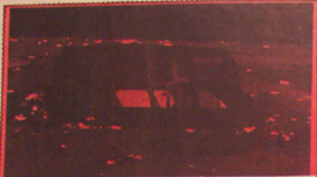
Roof of So. California Headquarters after pigs attempted to dynamite.

Monday, December 8th, at the scene off, for a tradition of those who were arrested, in an attempt to wipe out the Black Panther Party in Los Angeles.